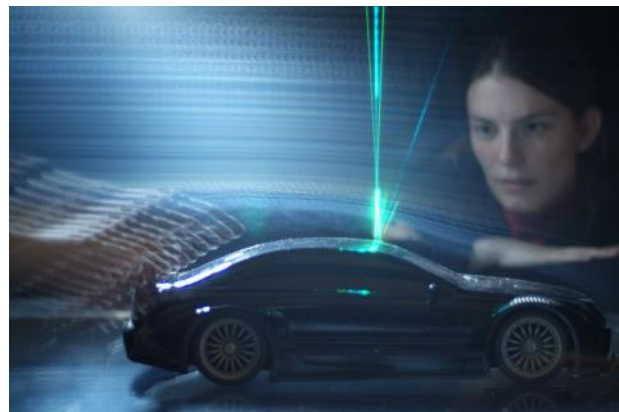
German technology at its best