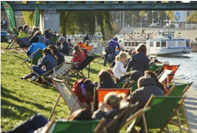
City life at the river Spree

The tour, 31 January – 6 February 2016, organised by the German Academic Exchange Service (DAAD), will be held in English and will provide a unique insight into innovative research activities in German universities, research institutes and industry.