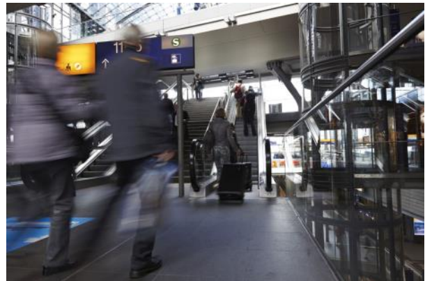
Travel through Germany