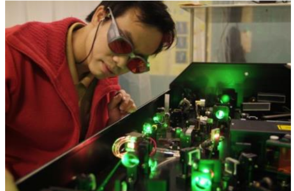
DAAD scholarship holder at Uni Rostock

Applicants are requested to submit four complete sets of documents including the application forms and final academic records not later than the given deadlines during office hours at the DAAD Information Center Bangkok ( www.daad.or.th ).